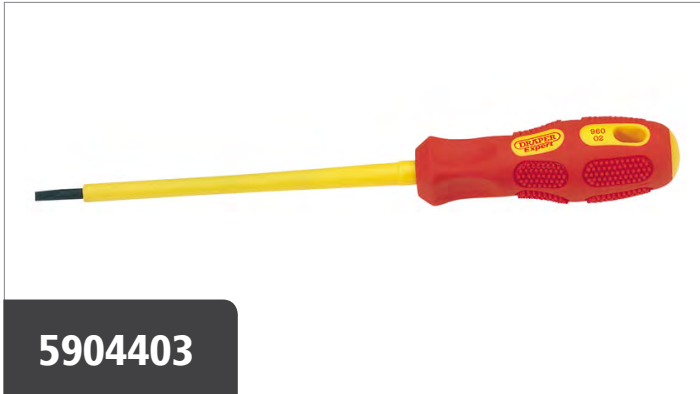
5904403 FULLY INSULATED PLAIN SLOT SCREWDRIVER 3 x 100mm Manufactured and individually certified to EN 60900

Expert Quality, tested to 10kV, suitable for working on live circuits of 1kV AC and 1.5kV DC. Made with SVCM alloy steel blades which are hardened, tempered and chemically blacked. Fully insulated ergonomic soft grip handle with deep set blade sheath for total safety. Sold loose.