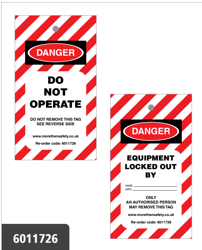
6011726 TAG-DOUBLE SIDED DANGER DO NOT OPERATE (PKT 10)