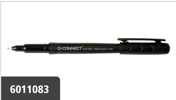
6011083 PERMANENT MARKER PEN

For writing on tags used in Lockout / Tagout situations.