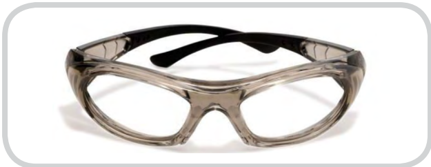
Boss - Grey