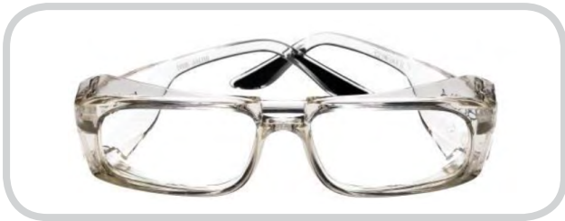
B805 - Clear