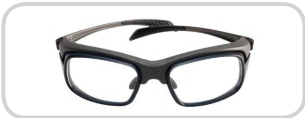
Slide - Black