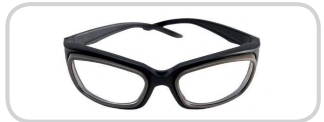
Urban - Black