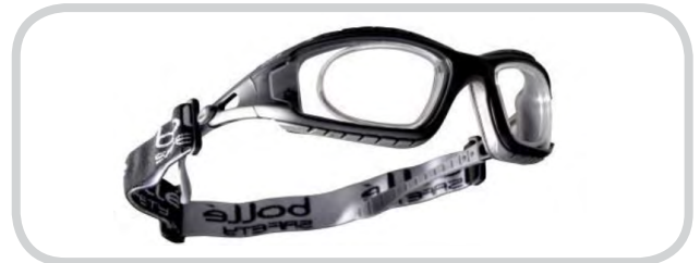
Tracker RX - Black