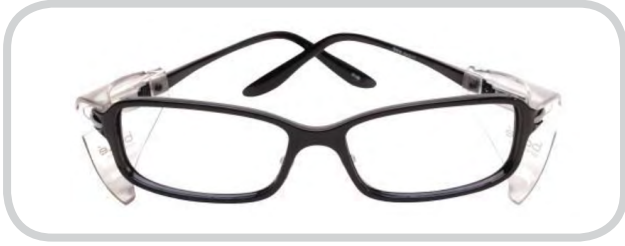
B806 - Black Plastic