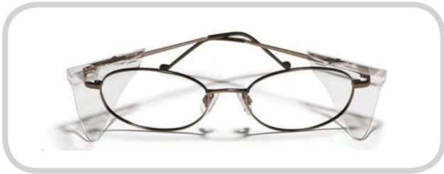
B709 - Gunmetal