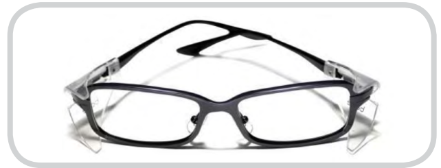
B806 - Aluminium