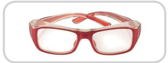
B808 - Red