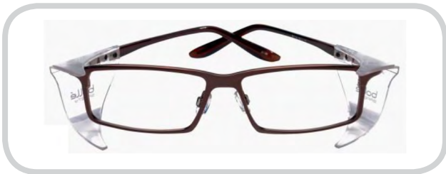
B712 - Bronze