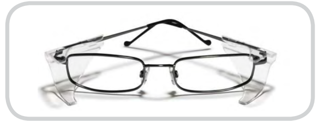
B710 - Gunmetal