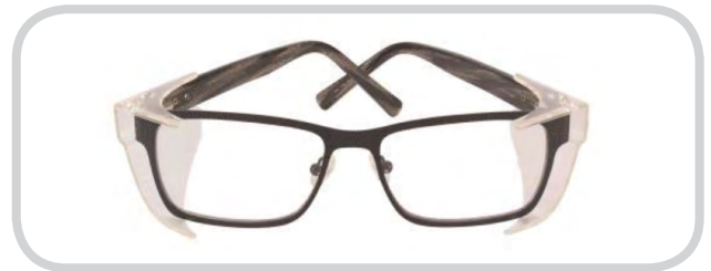
B713 - Black