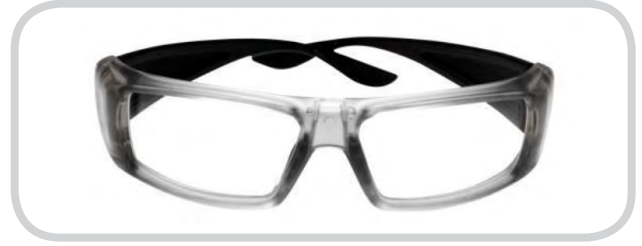
B807 - Grey