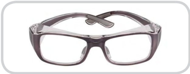
B808 - Dark Bronze