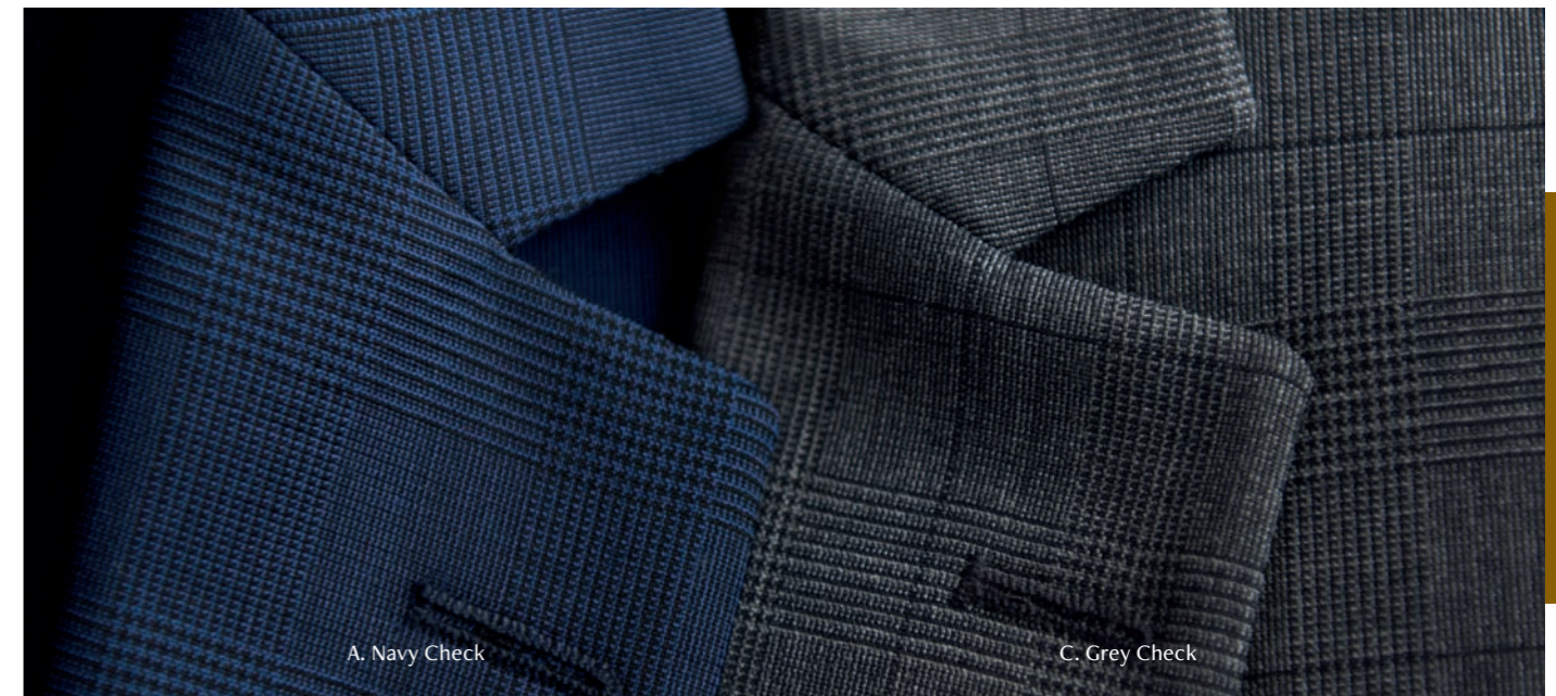
A. Navy Check