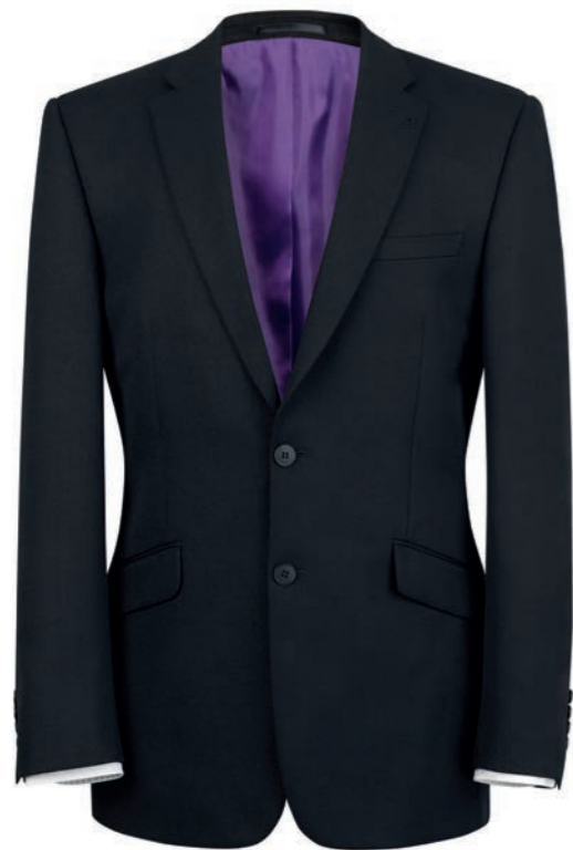
JUPITER TAILORED FIT JACKET 3344 A,D

Sizes: 38" - 44" short 34" - 50" regular 40" - 46" long