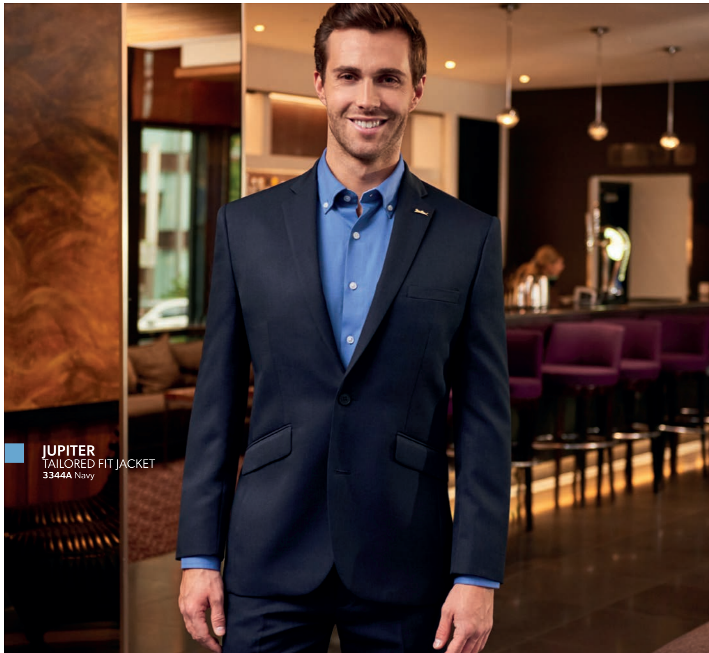
JUPITER TAILORED FIT JACKET 3344A Navy