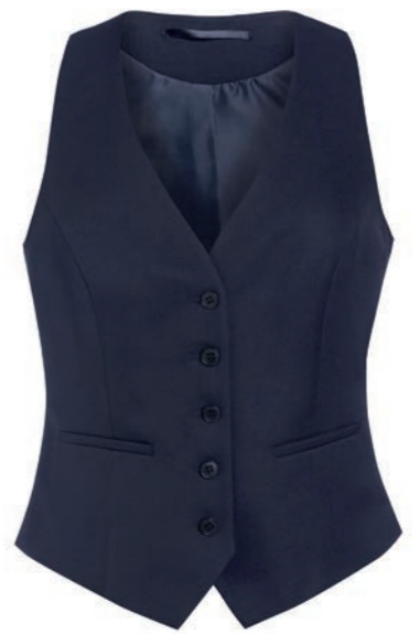
LUNA WAISTCOAT 2257 A,D

Sizes: XS 4 - 6 S 8 - 10 M 12 - 14 L 16 - 18 XL 20 - 22 XXL 24 - 26