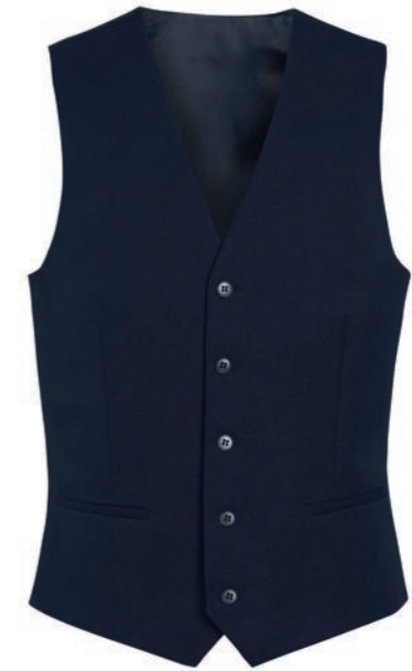
MERCURY WAISTCOAT 1295 A,D

Sizes: XS 34" - 36" S 38" - 40" M 42" - 44" L 46" - 48" XL 50" - 52"