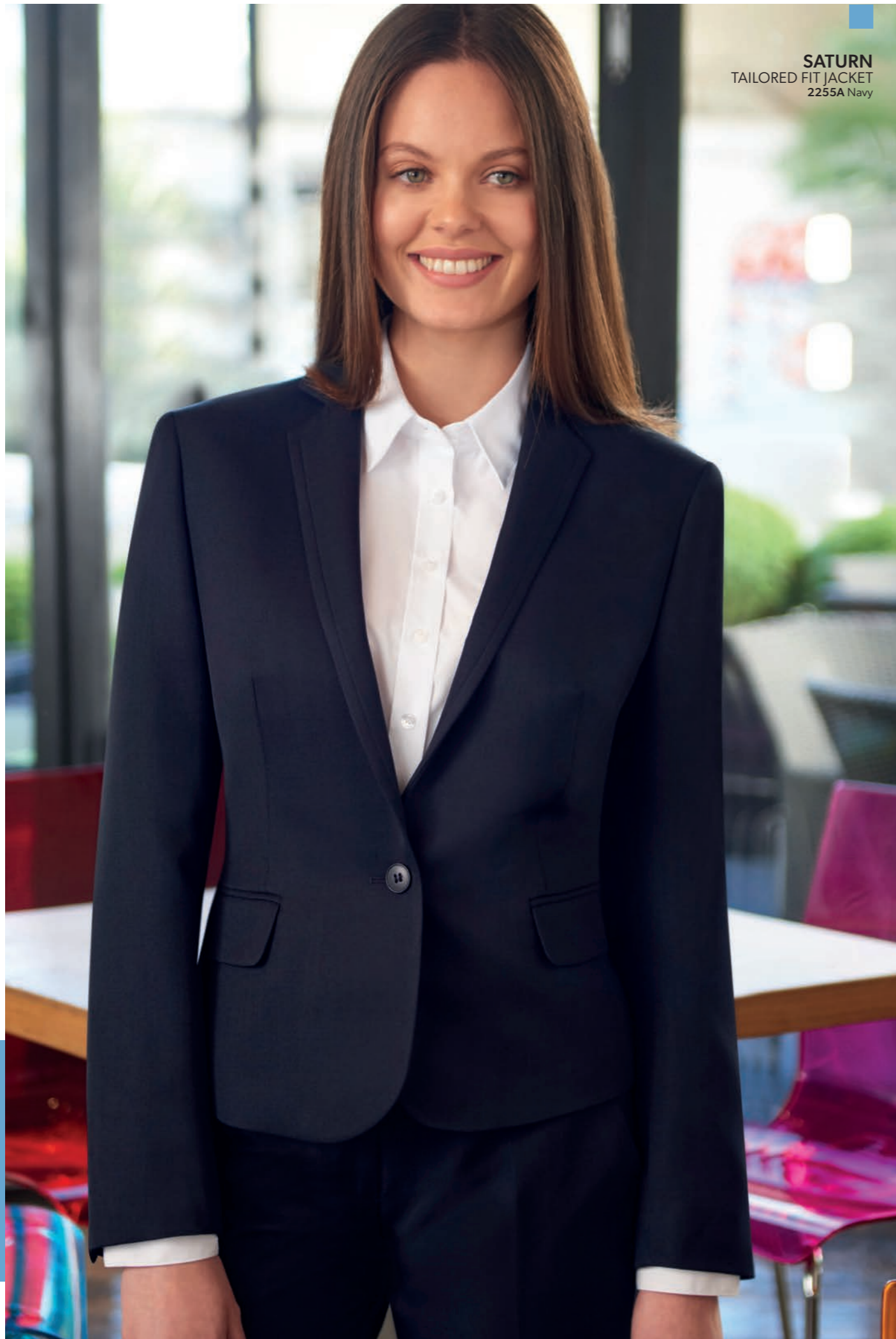
SATURN TAILORED FIT JACKET 2255A Navy