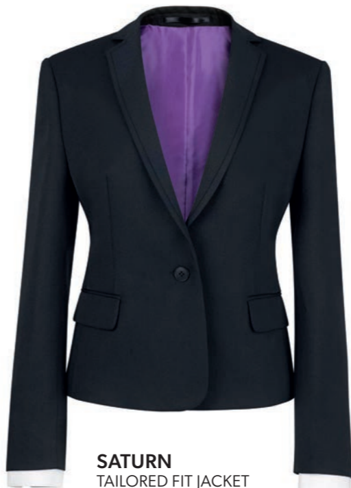
SATURN TAILORED FIT JACKET 2255 A,D

Sizes: 8 - 16 short 4 - 26 regular 10 - 18 long